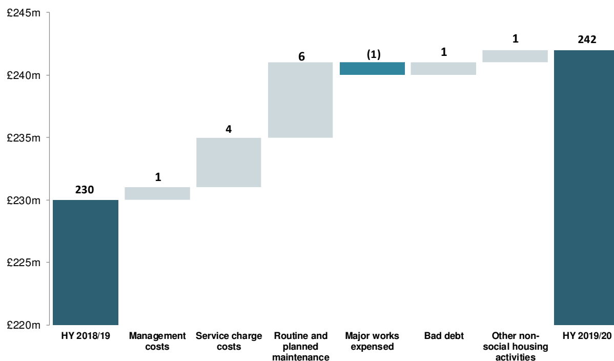
Figure 2: Movement in operating costs (£m)

At £242 million, operating costs are £12 million (5%) higher than the same period last year, resulting in an operating cost per unit of £2,224 (H1 2018/19: £2,119).